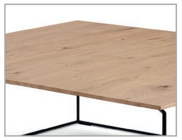
Different sizes and wood variants available