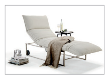
Functional lounger Lettino, single or...