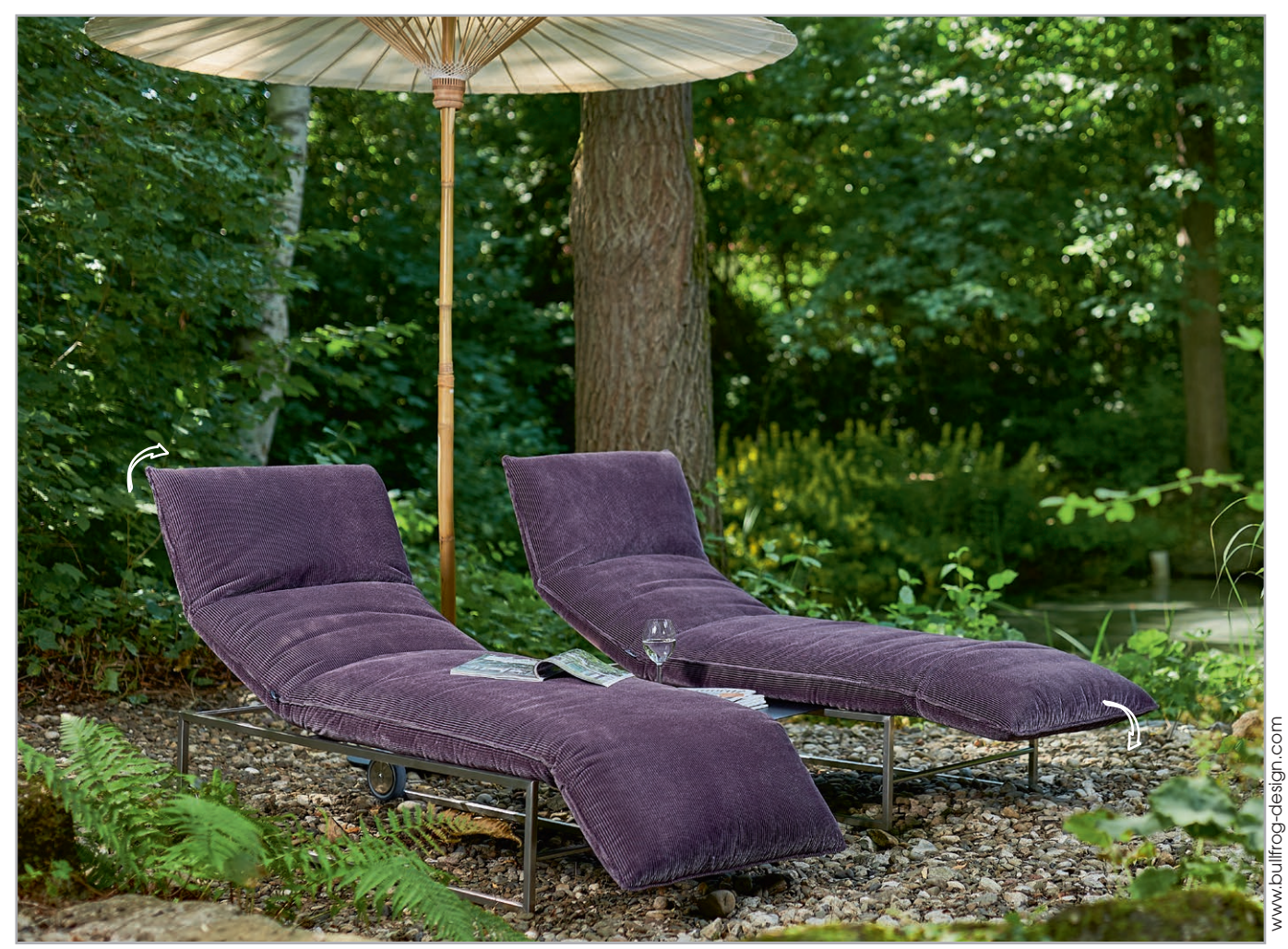
Lounger Lettino with intermediate table